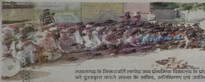
तखतगढ़ के निकटवर्ति लापोद उच्च प्राथमिक विद्यालय के प्रांगण में विद्यार्थियों को पुरस्कृत करते संस्था के सचिव, अतिथिगण एवं उपस्थित भौड।